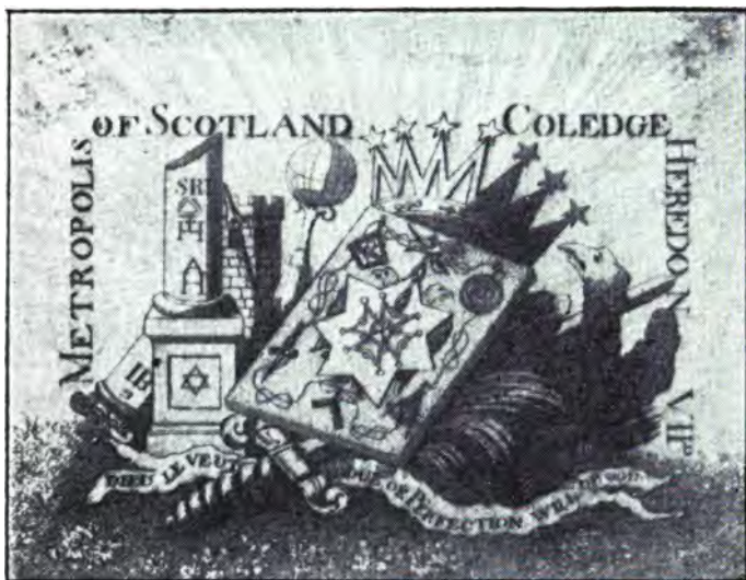
PLATE OF LODGE OF PERFECTION OF SCOTLAND