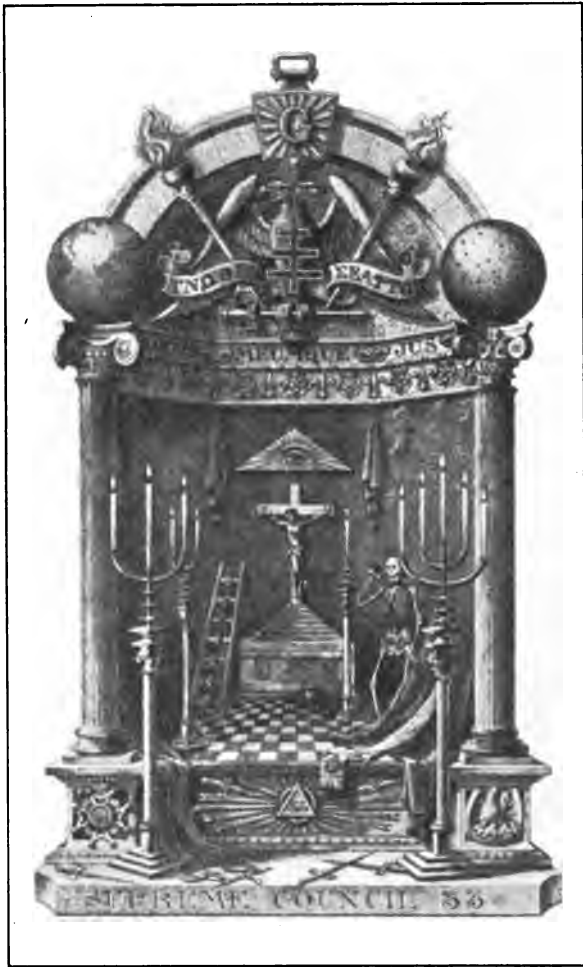
PLATE OF SUPREME COUNCIL Designed by W. P. Barrett